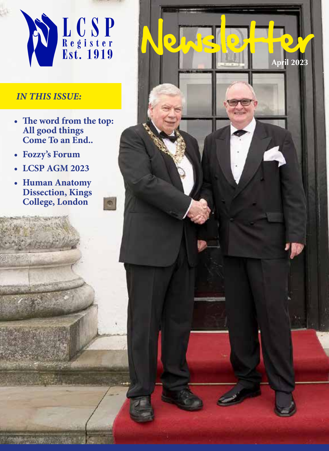
THE latest news for Remedial, Sports & Manipulative Therapists